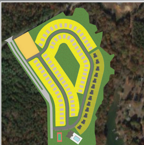
ACTIVE ADULT & SINGLE FAMILY