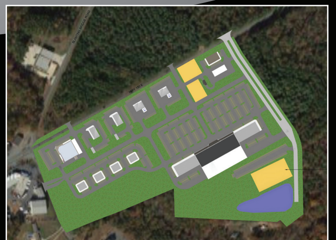
COMMUNITY RETAIL PARK